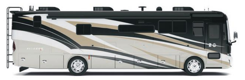
G3 GOLD CORAL

Our eight-step full-body paint system features premium grade paints sealed with three layers of superclear coat with ultraviolet protection. An additional layer of high-performance film protects the front of the coach and select areas.